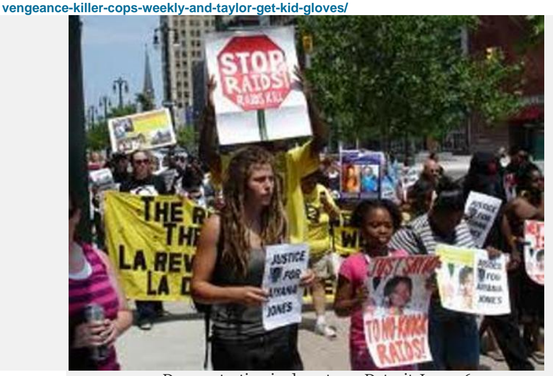
Demonstration in downtown Detroit June 26, 2010

http://voiceofdetroit.net/2011/10/21/worthy-goes-after-aiyana-jones%e2%80%99-dad-with-a-