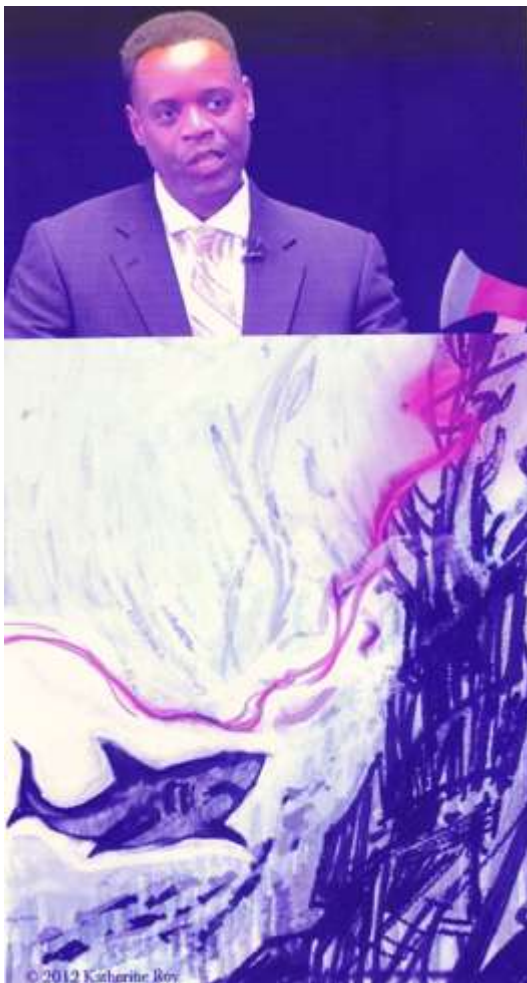
Orr: between devil and deep blue sea

Orr has already imposed drastic health care out-of-pocket costs additionally that will put thousands in poverty. Such benefits are actually protected under Chapter 9, which declares any cuts must be “fair and equitable.” (Click on Ch9 US Code Payment of Insurance Benefits to Retired Employees. )