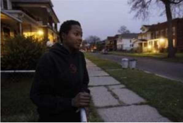
Woman in Highland Park outside home after DTE removed all street lights because city could not pay DTE bill. Public Lighting Authority proposes to remove 40 percent of Detroit's street lights.

Meanwhile, Orr and his vulture partners from Jones Day and other law firms purporting to represent Detroit are slating $0 from the city's general fund for pensions.