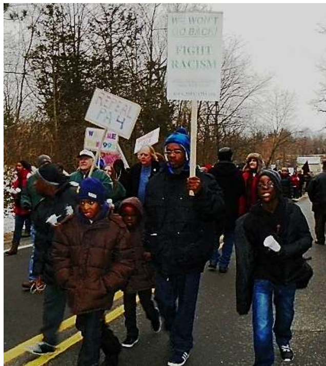
Thousands of marchers descended on Michigan Gov. Rick Snyder’s home outside Ann Arbor on MLK Day, 2011 to demand an end to racist EM laws.

Under terms of POA4, the banks get their debt payments FIRST , prior to the provision of city services for the residents of Detroit. What about street lights, garbage pick-up, reconstruction of Detroit neighborhoods devastated by illegal and predatory bank lending and foreclosures, and jobs for the youth in the public sector, which “Mayor” Mike Duggan is rapidly privatizing?