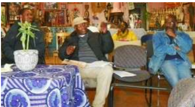
Retirees at N'namdi's meeting. The Detroit Concerned Citizens, Active Employees and Retirees meets there, at 12150 Woodward in Highland Park, every Monday at 11 a.m.

At a recent meeting of the Detroit Concerned Citizens, Active Employees and Retirees, (DCCAER) one retiree pointed out that actuarial figures used to compute the amount of pension and annuity cuts for each individual retiree, including the retiree's expected life span, are race-based and therefore also discriminatory.